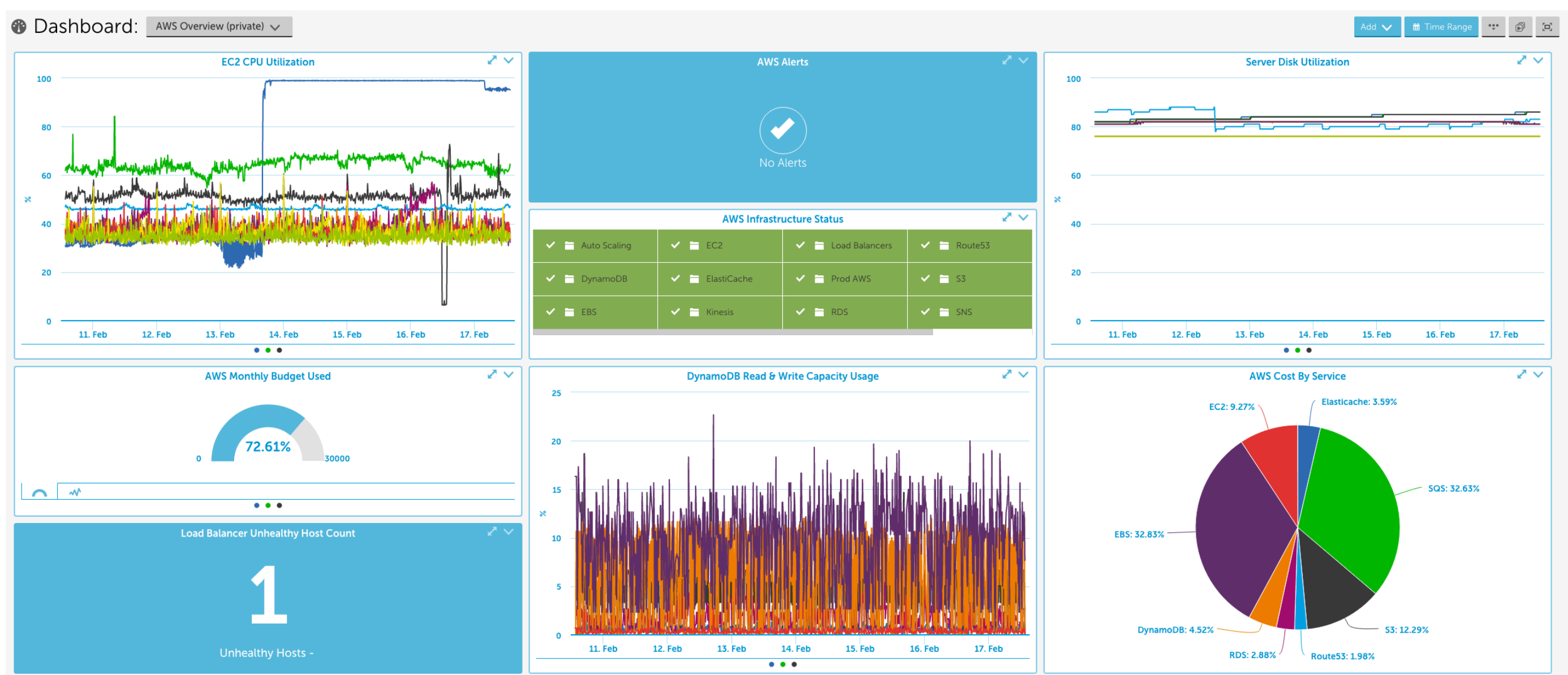
AWS dashboard in LogicMonitor

In a monitoring platform like LogicMonitor, users can easily build dashboards to view the performance of their datacenter infrastructure alongside their AWS resources.